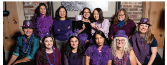
Decoda staff put on their purple for September is Literacy Month.