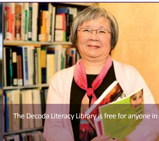
The Decoda Literacy Library is free for anyone in BC to borrow!