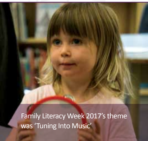
Family Literacy Week 2017's theme was 'Tuning Into Music'

Vision: A British Columbia where everyone has the literacy skills they need.