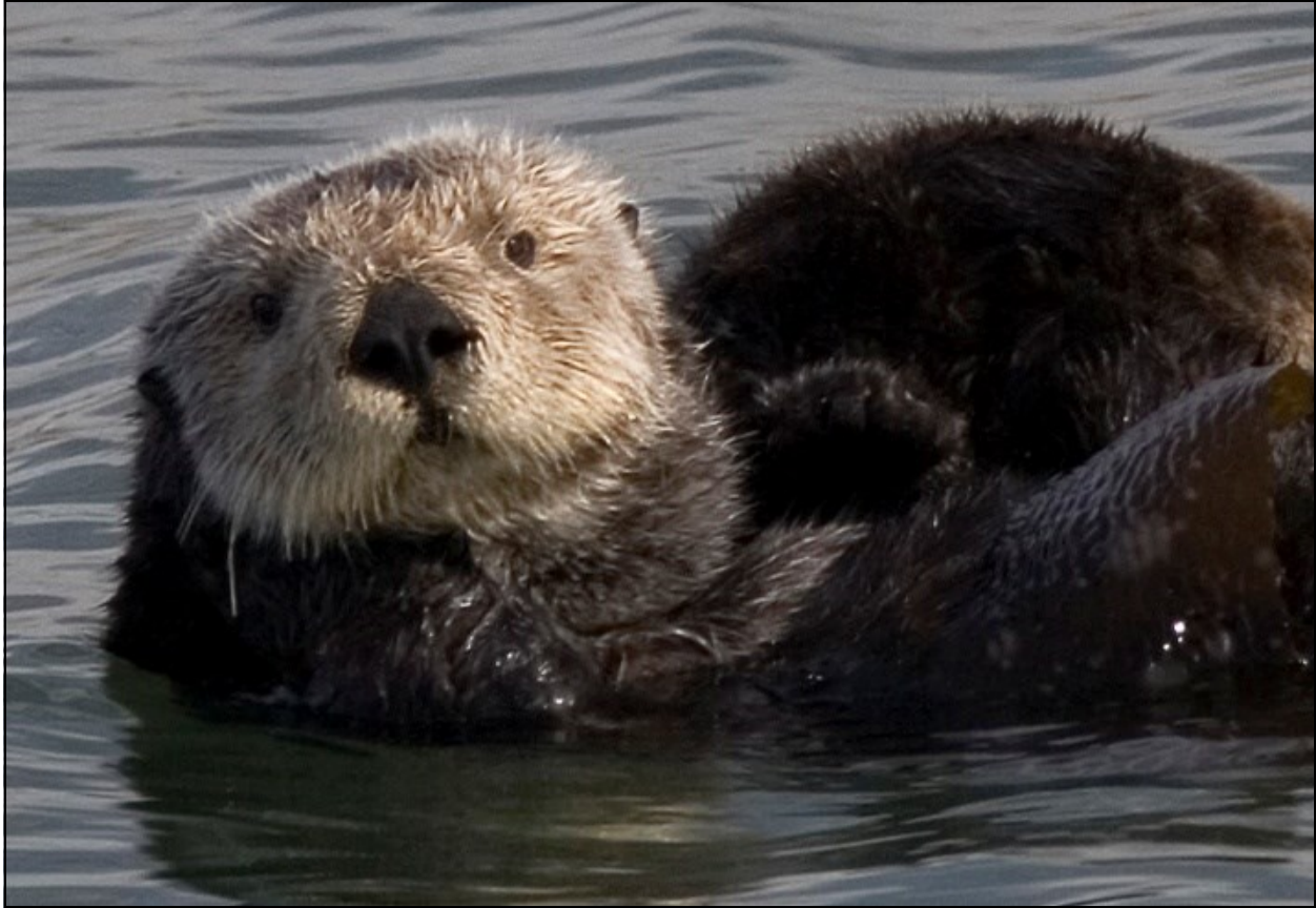
The Sea Otter is an endangered species.