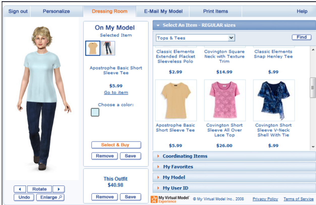
Sears My Virtual Model Experience for shopping online