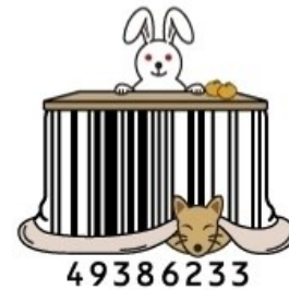
New Japanese barcodes are at least entertaining.

Retail is one of the most competitive industries. Merchants keep cutting costs wherever they can to increase profit margins. They