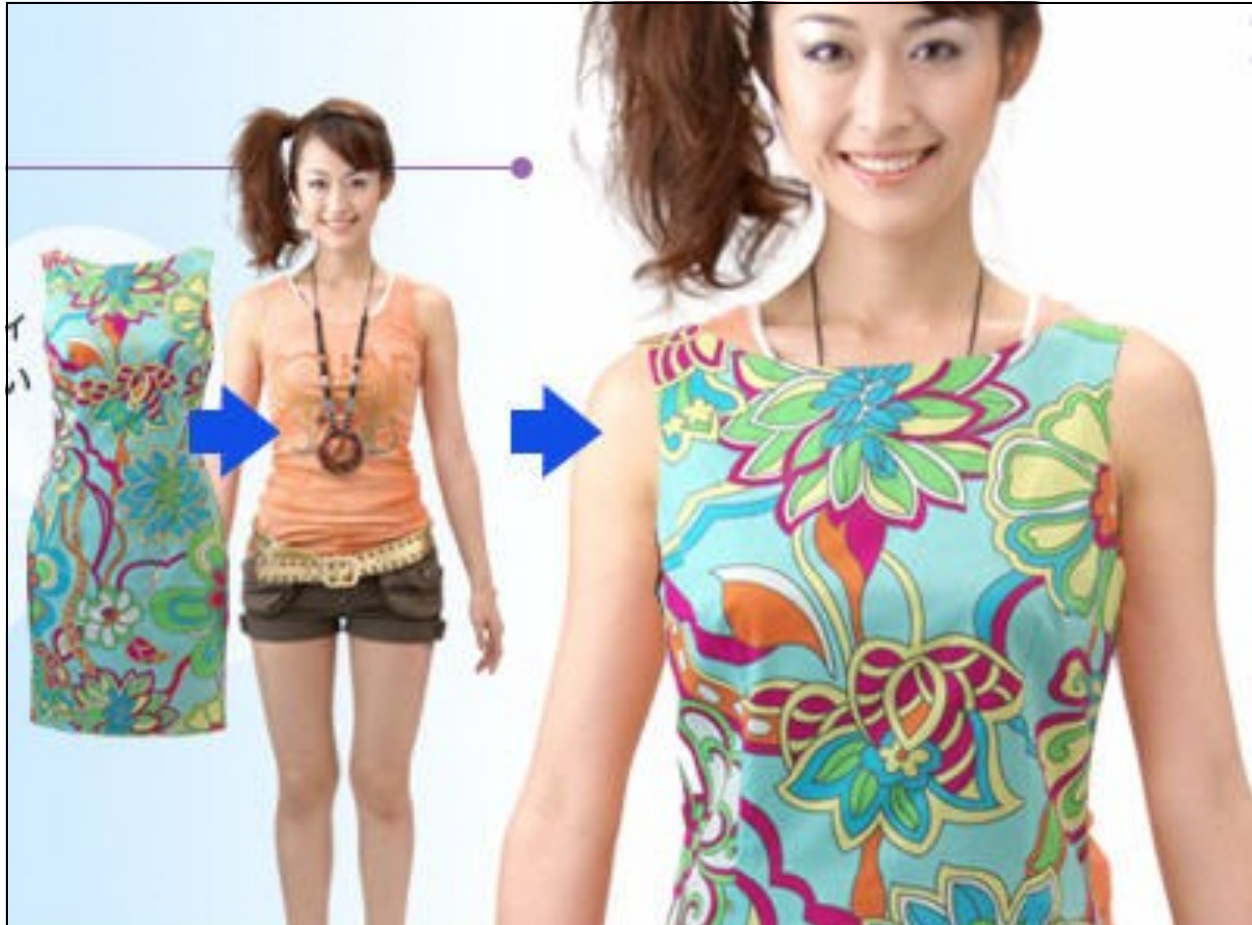
Picture of yourself uploaded on the Internet