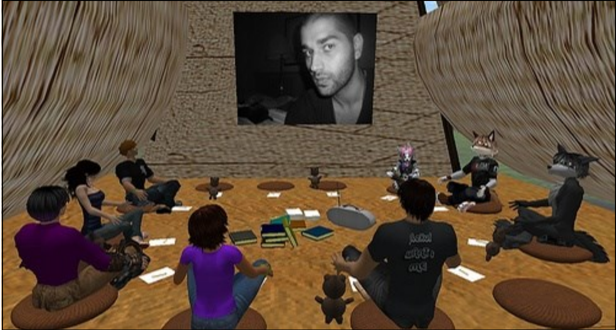
“Deconstructing Darfur” workshop held for teens in Teen Second Life virtual world