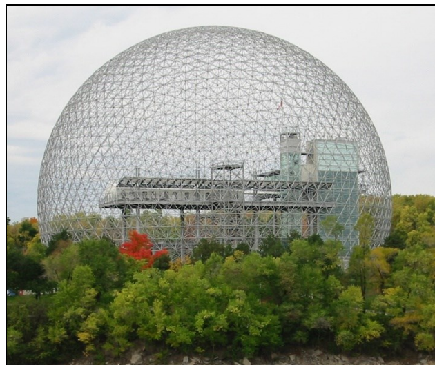
The Montreal Biosphere designed by Buckminster Fuller, 1967 offers a futuristic vision of a better world led by science and technology

Looking Backward: 2000-1887 is a utopian novel written by Edward Bellamy in 1887. In the U.S. it was the third best-selling book of the 19th century. The story is about a man who falls asleep in the year 1887 and wakes up in the year 2000. He spends most of the book talking about the wondrous changes that had occurred in the previous century. This is one of the few books that actually created a political movement. It captured the imagination of a population looking forward to the 20th century with great concern.